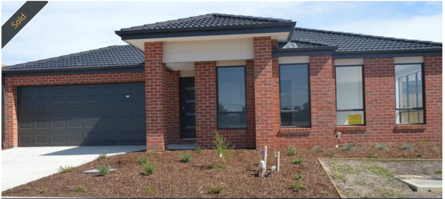
Unit 1, L83 Parklink Drive, Cranbourne East