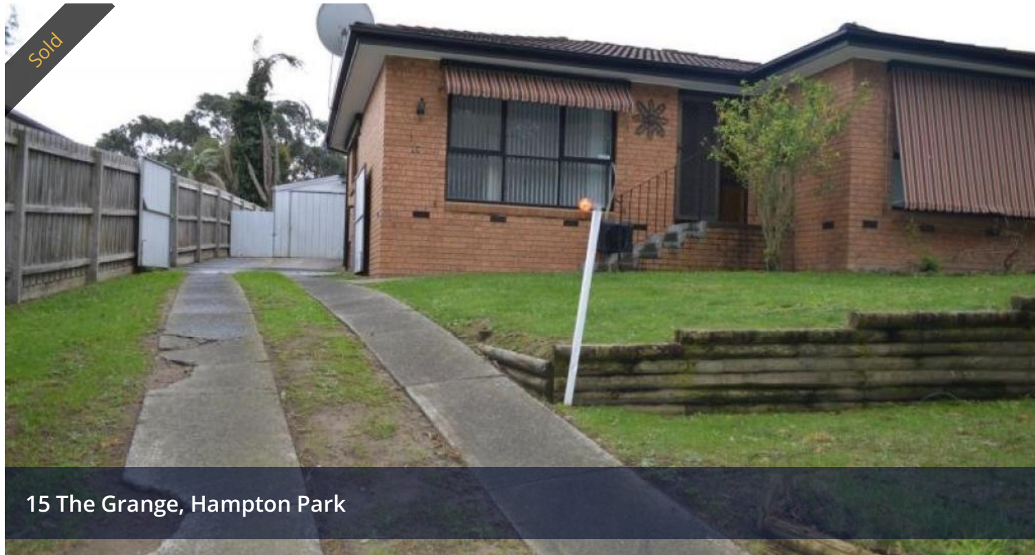
15 The Grange, Hampton Park