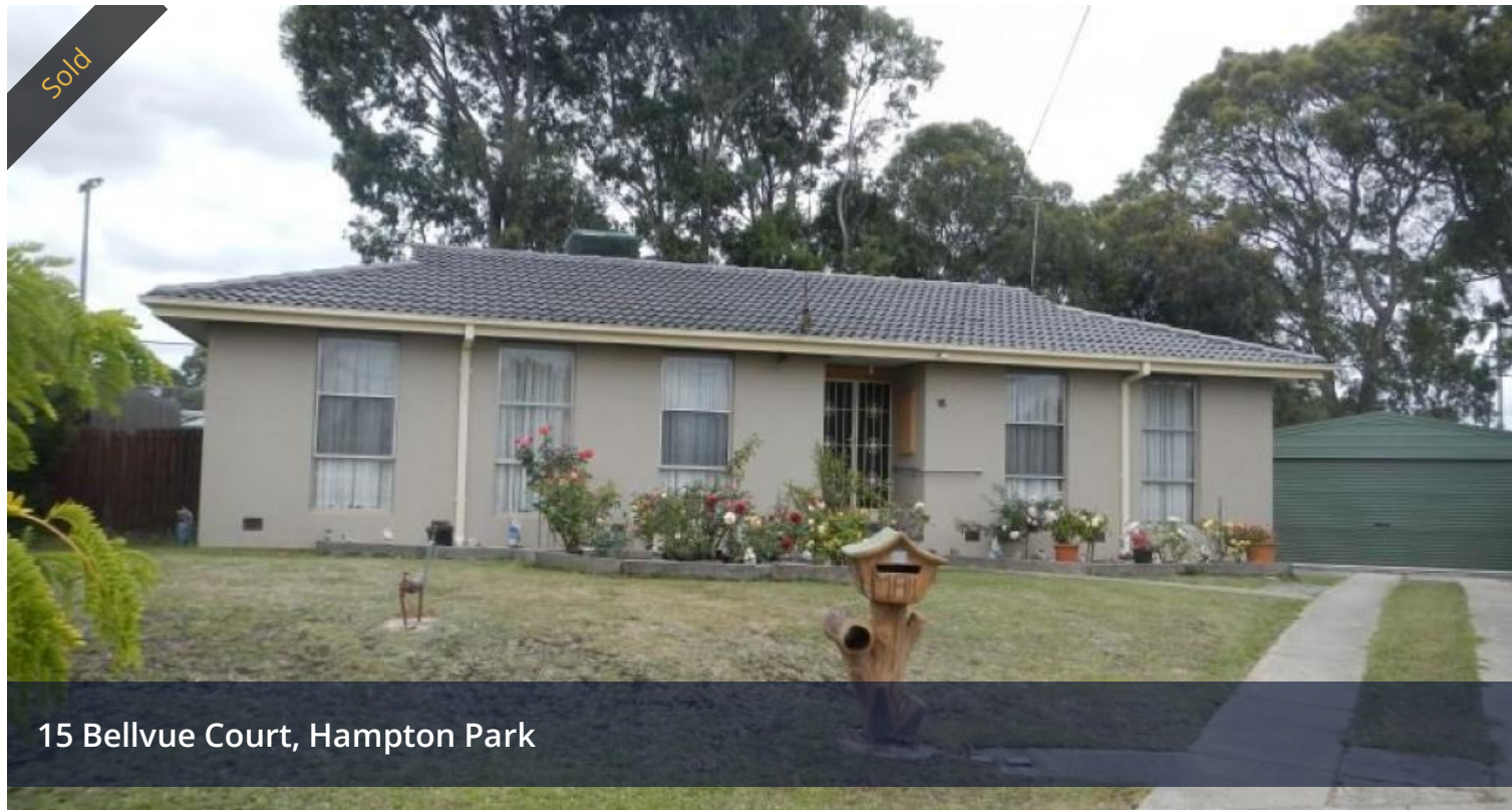
15 Bellvue Court, Hampton Park