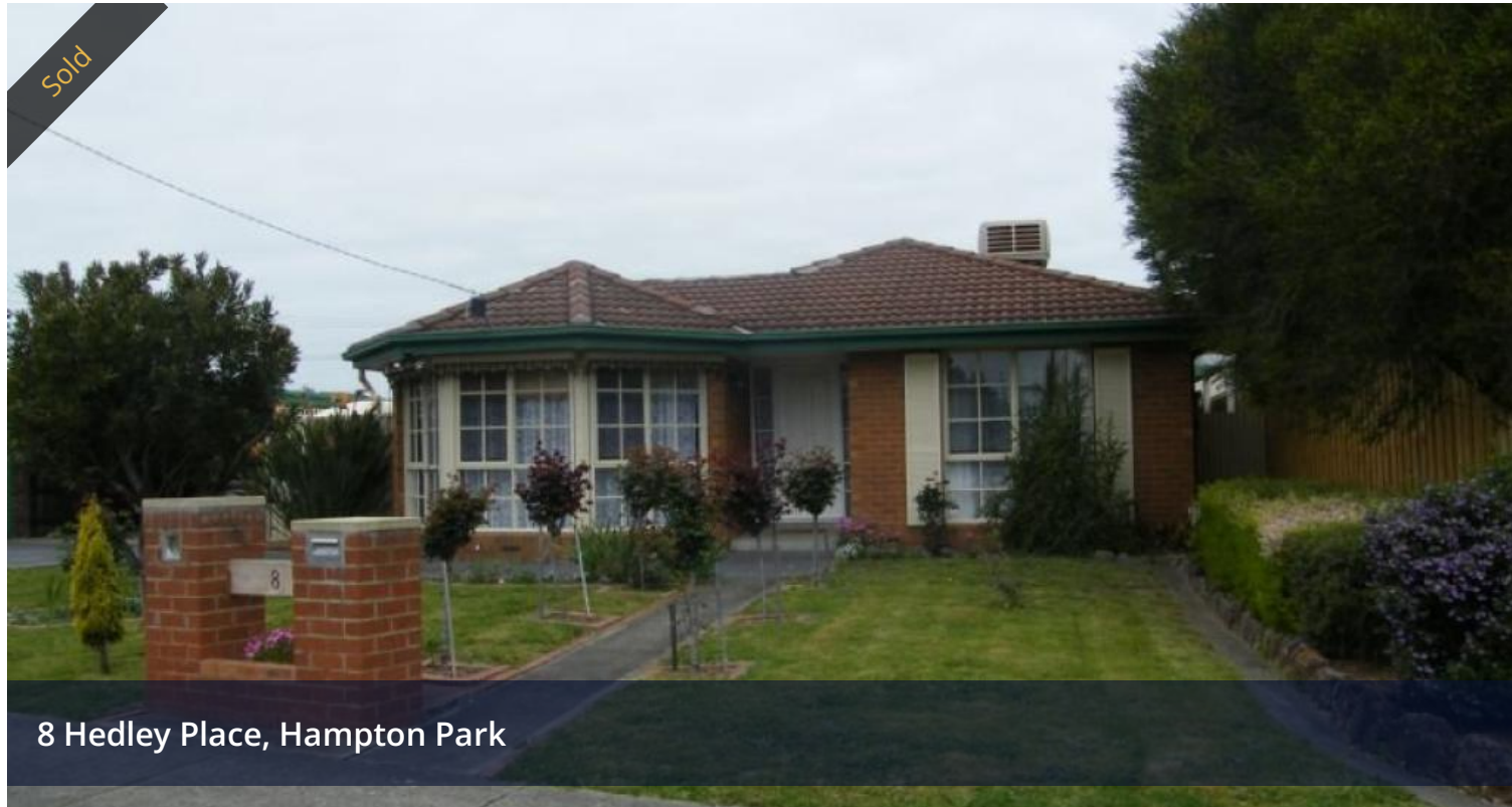
8 Hedley Place, Hampton Park