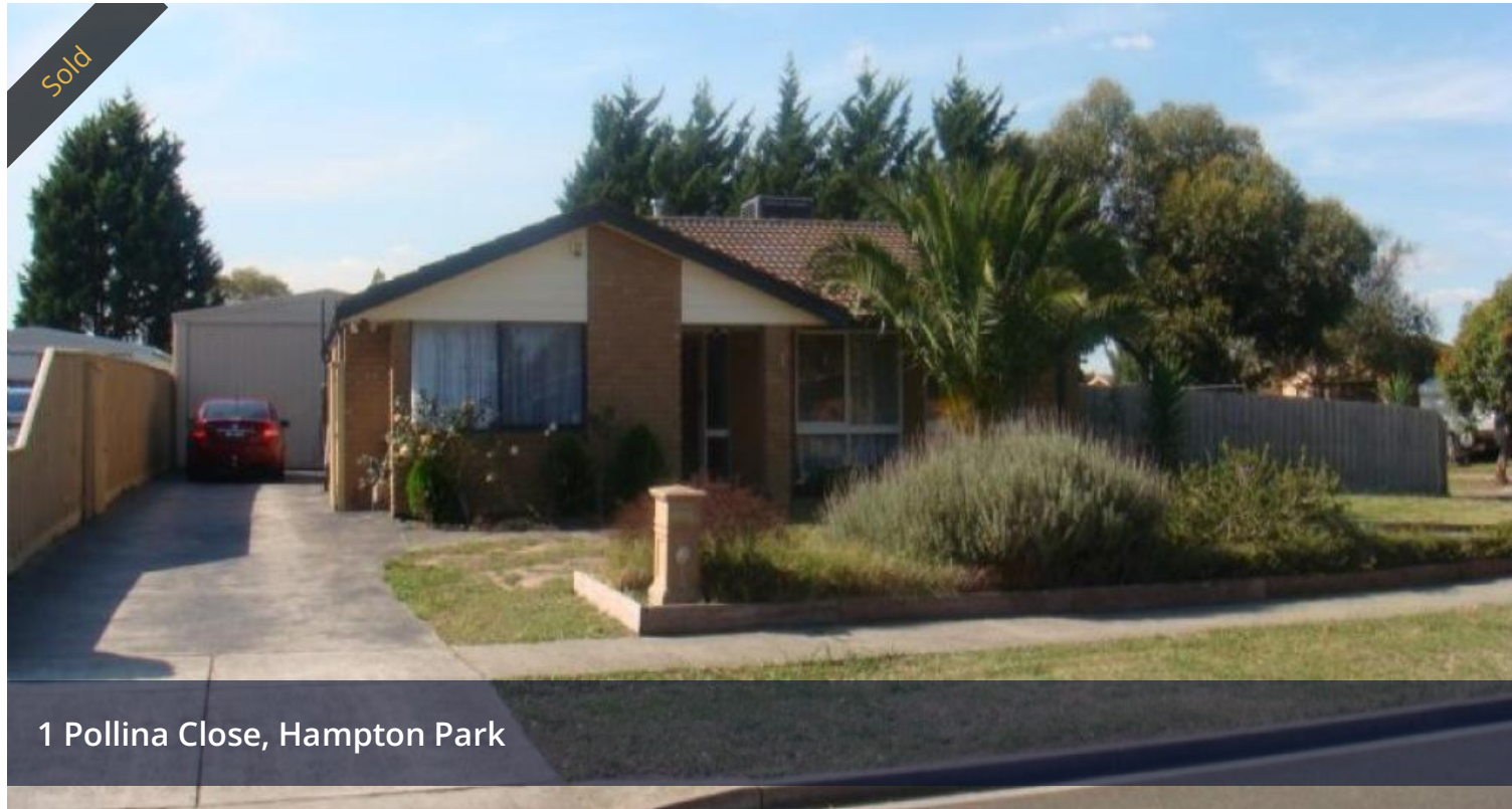
1 Pollina Close, Hampton Park