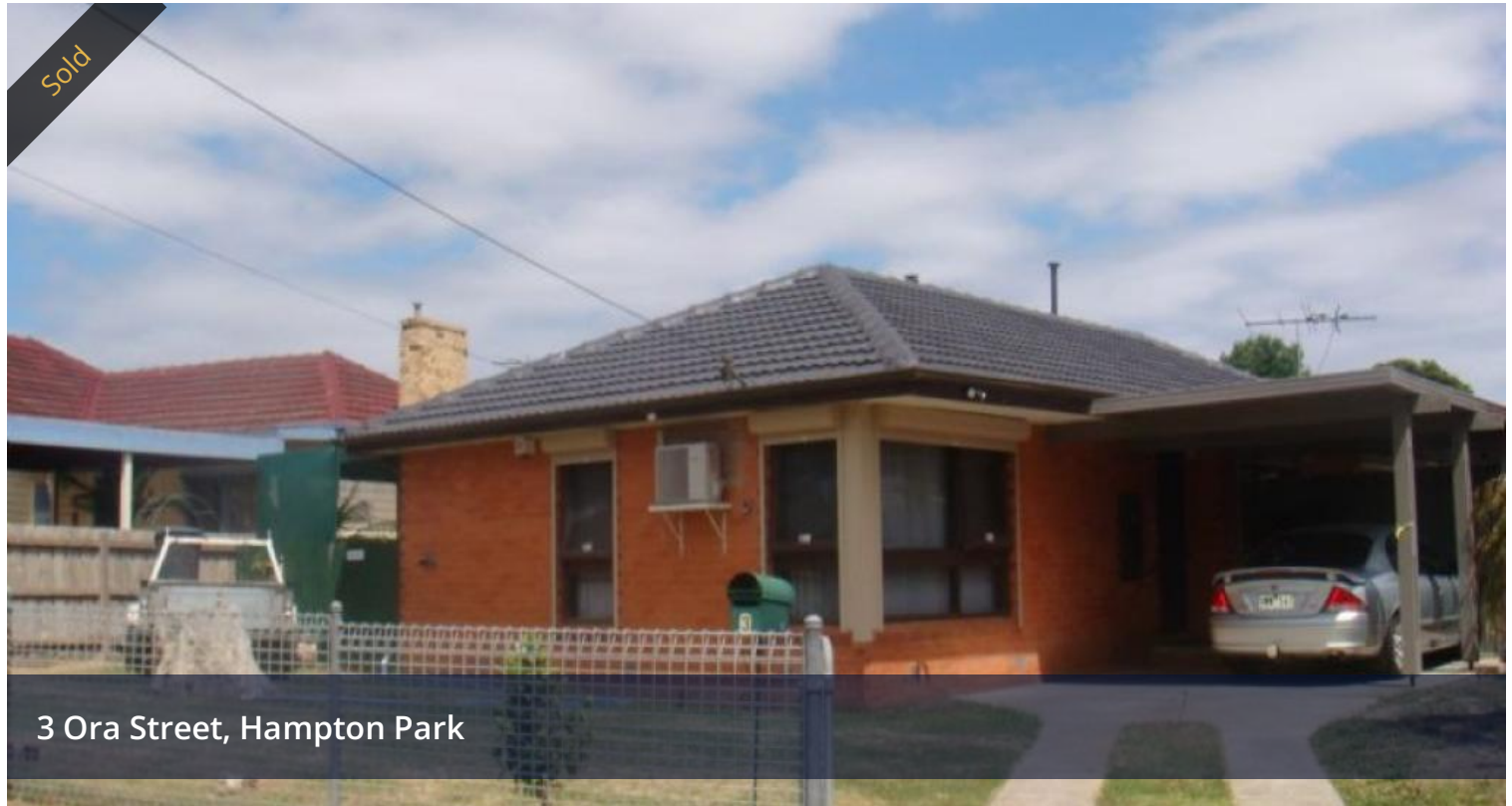
3 Ora Street, Hampton Park