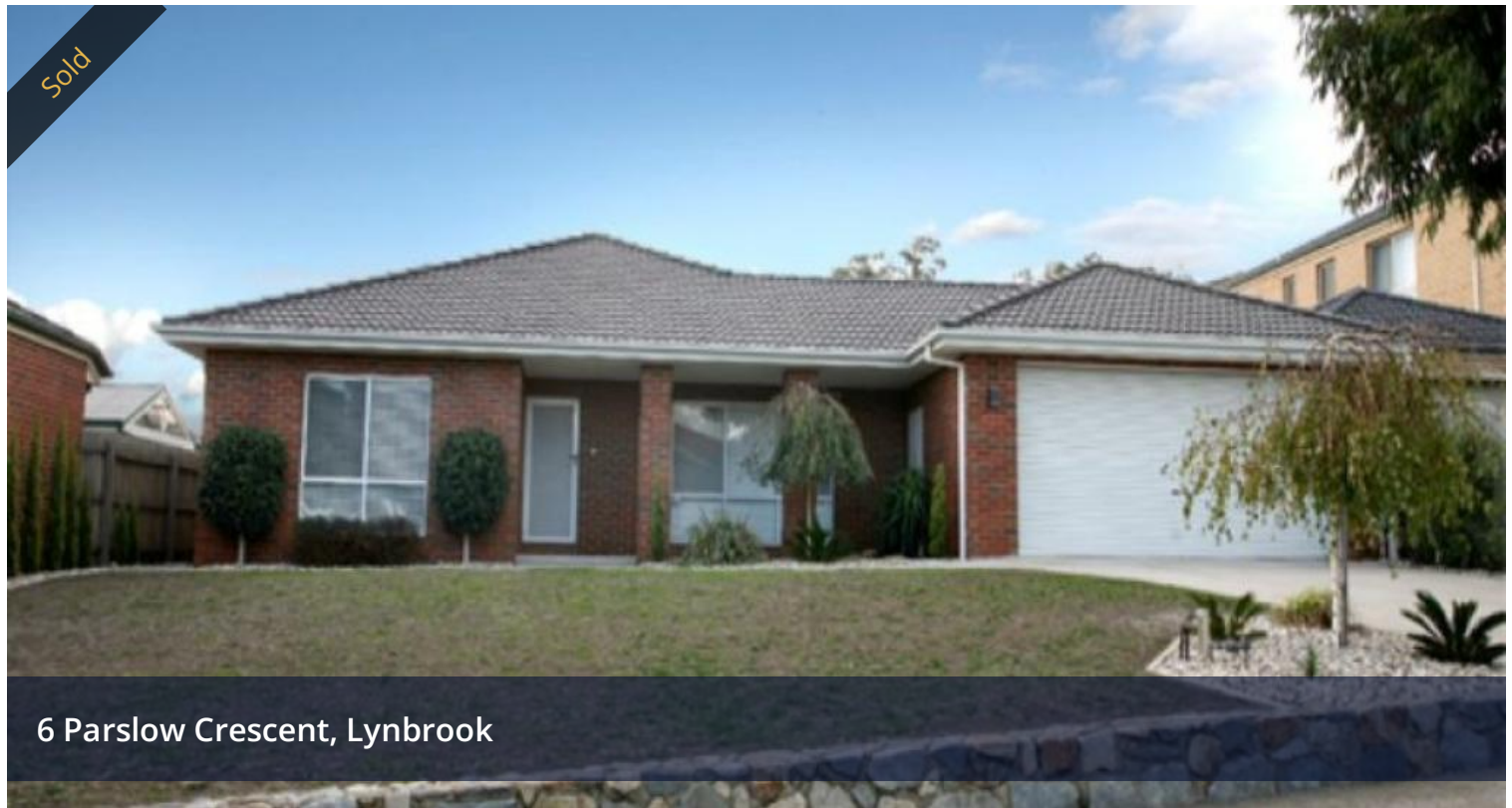
6 Parslow Crescent, Lynbrook