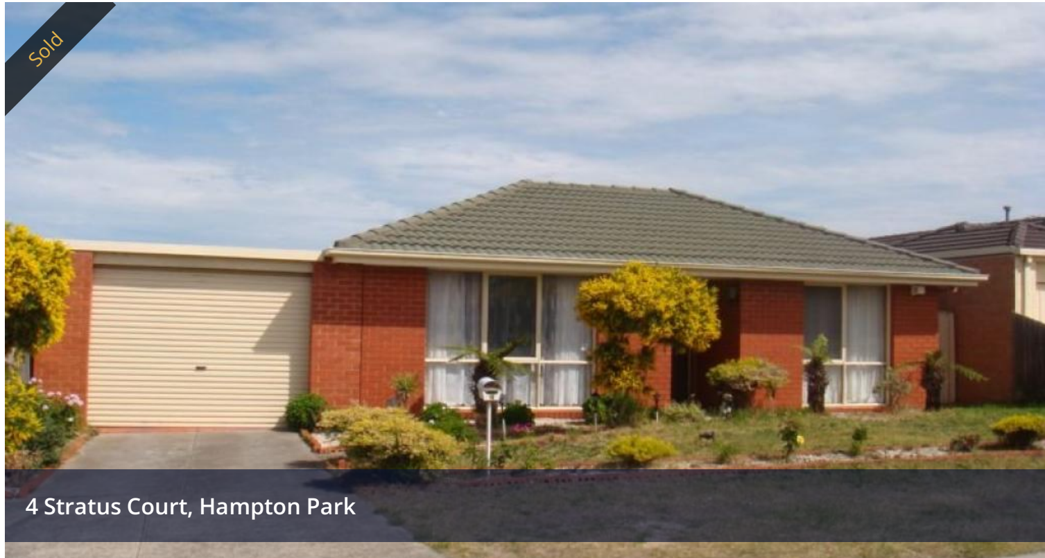
4 Stratus Court, Hampton Park