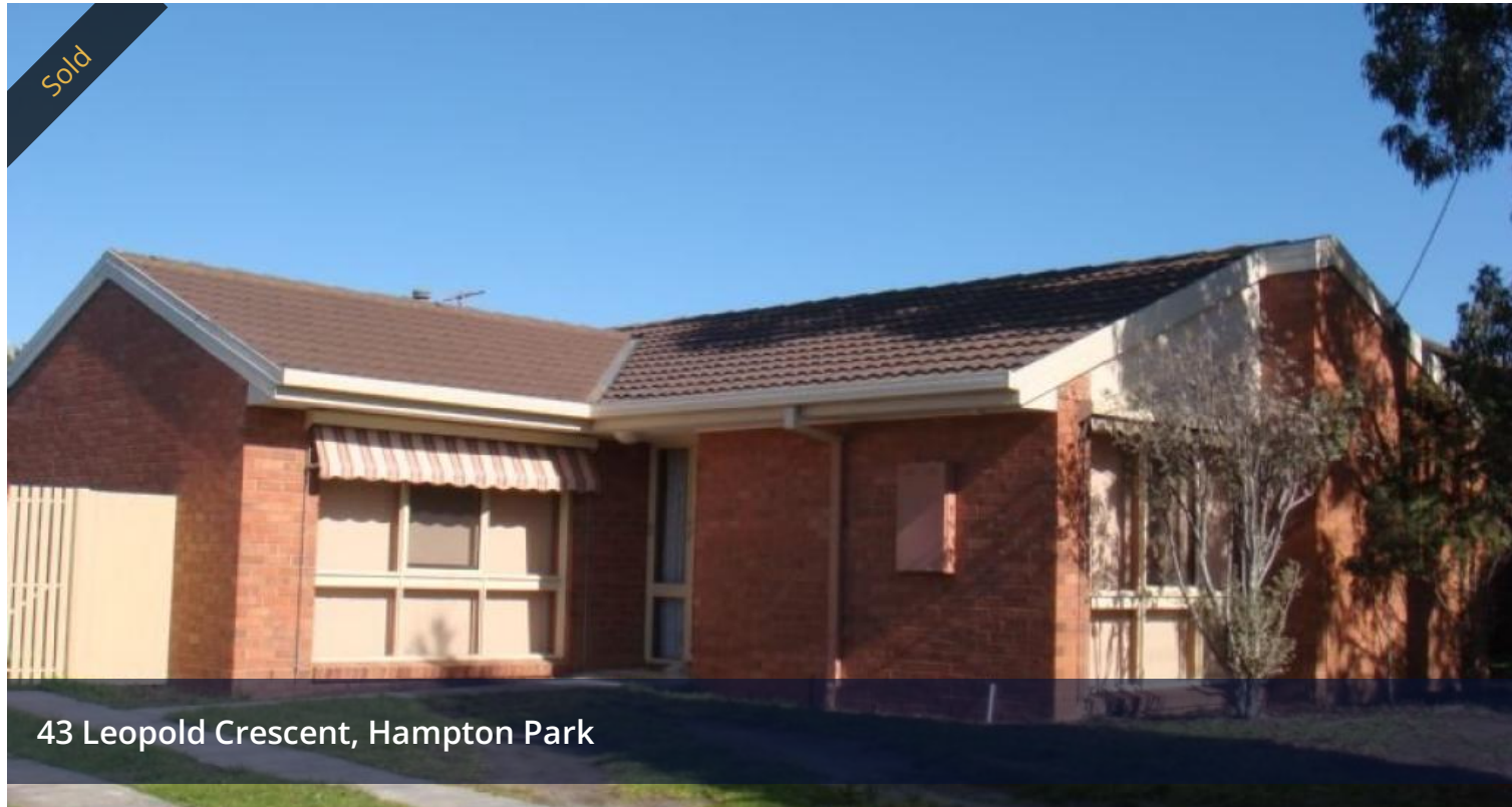
43 Leopold Crescent, Hampton Park